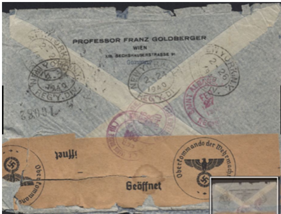
Artifact: Franz Goldberger letter

https://collections.ushmm.org/search/catalog/irn60926#?rsc=21422&cv=0&c=0&m=0&s=0&xywh=-1%2C-92%2C2060%2C1709