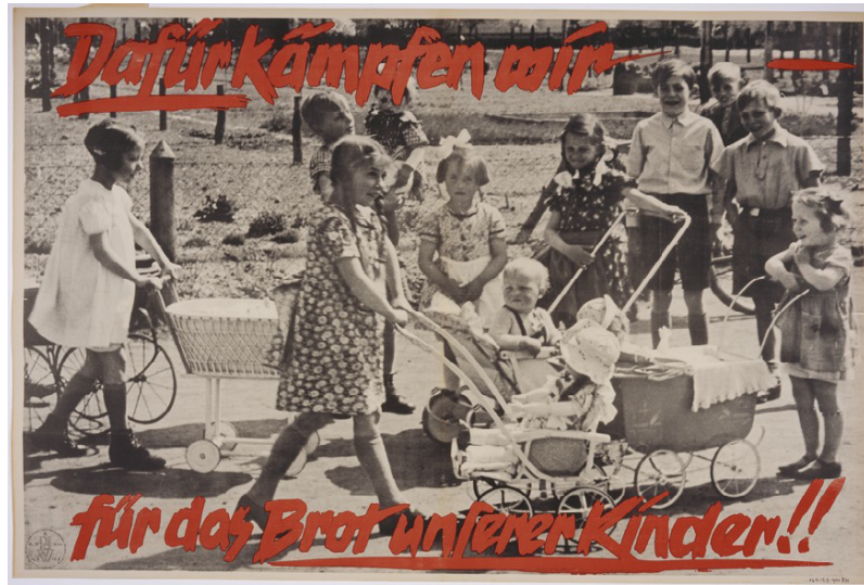
“Why We Fight—for Our Children’s Bread! March 11, 1940.