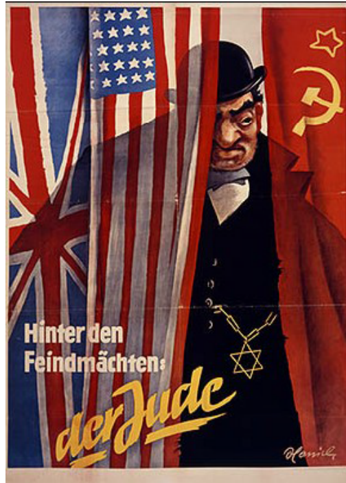
“Behind the Enemy Powers: The Jew.” 1942.