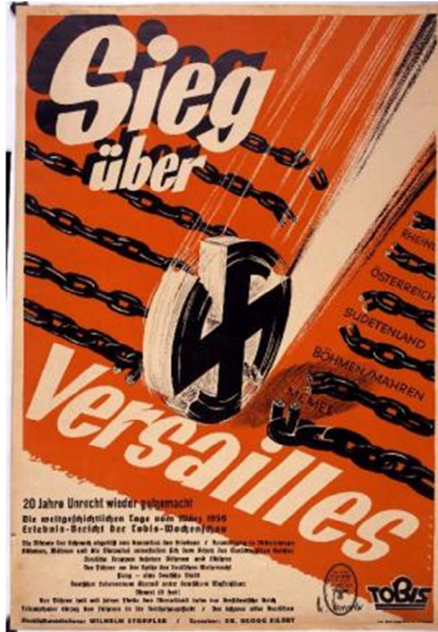
“Victory over Versailles.” 1939. Wolfsonian